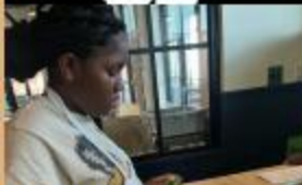
ETS Middle School Chef's