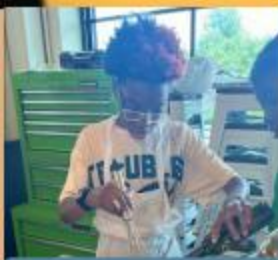
ETS Middle School Chef's

Thanks for being part of our journey — here's to many more exciting moments ahead!