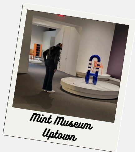
Mint Museum Uptown

EOC's first Fall Festival took place on October 19 th at the AICC office in Quorum Business Park! Participants enjoyed fun experiences like face painting, games, fall treats, and pumpkin painting. We also hosted various vendors that serve the community, such as NACA (pictured), which aims to help underserved communities secure affordable housing, as well as colleges like Central Piedmont Community College and Johnson C. Smith University!